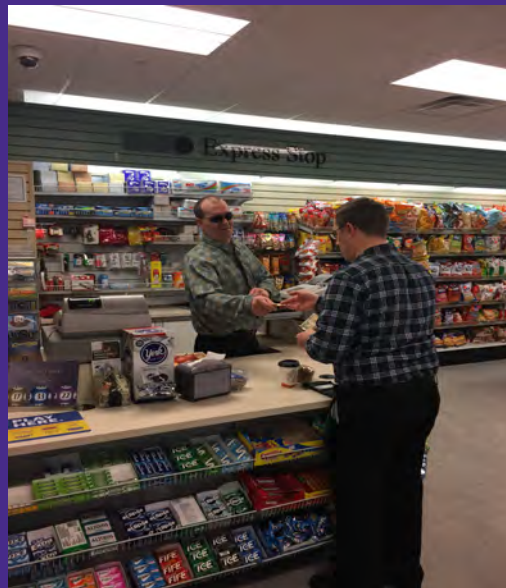
BEP vendor waiting on customer

Once the business is up and running, a BEP business services specialist visits monthly to provide support and assist with any issues.