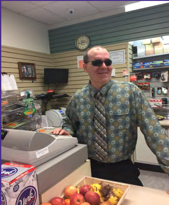
BEP vendor at cash register, ready to serve customers

Government statutes that govern this program provide a priority for blind vendors to operate food service facilities in federal and state government buildings.