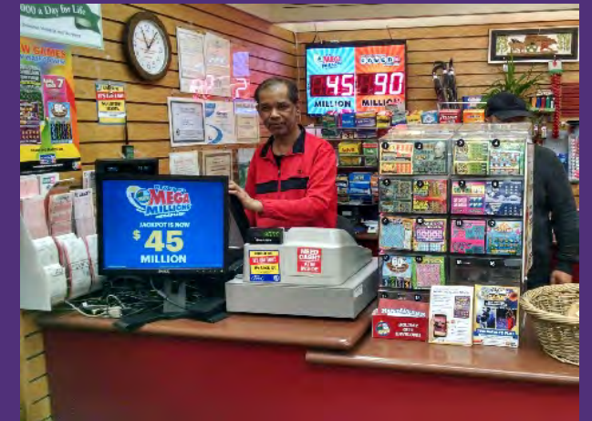
BEP vendor at store counter, with cash register and lottery terminal

Business training and management opportunities for eligible participants