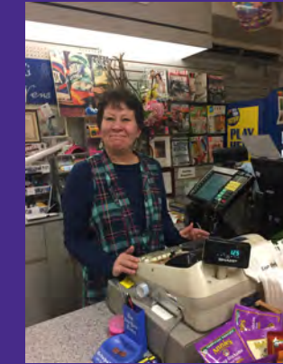
BEP vendor smiling as she greets customers

To learn more about becoming a Business Enterprise Program (BEP) vendor: